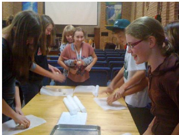
Team Cookie-Making was a lot of fun!

Keeping up with us is easy on Facebook; just search on "Incarnation Lutheran Youth" and then "LIKE" our page to receive the updates. Check out our webpage too at www.godamong.us/youth.html